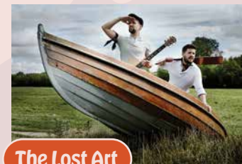
The Lost Art