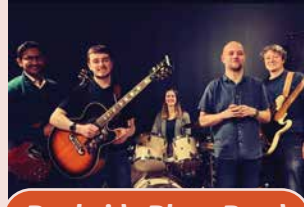
Bankside Blues Band