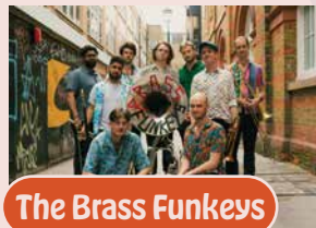
The Brass Funkeys