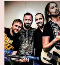
The Guitar Legends